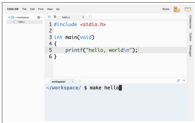
Figure 3: CS50’s first web-based programming environment, CS50 IDE, was ultimately built atop AWS Cloud9, backed by a Kubernetes cluster of Docker containers. Upon login, students were allocated a newly created container to which their own home directory was attached. Students could then write, debug, and execute code within that container via a web-based UI, complete with a code editor, file explorer, and terminal window, with AWS Cloud9’s default UI both simplified and enhanced for teaching and learning via the course’s own plugins.

docker run -it NAME with clang , gdb , and valgrind already installed for them.